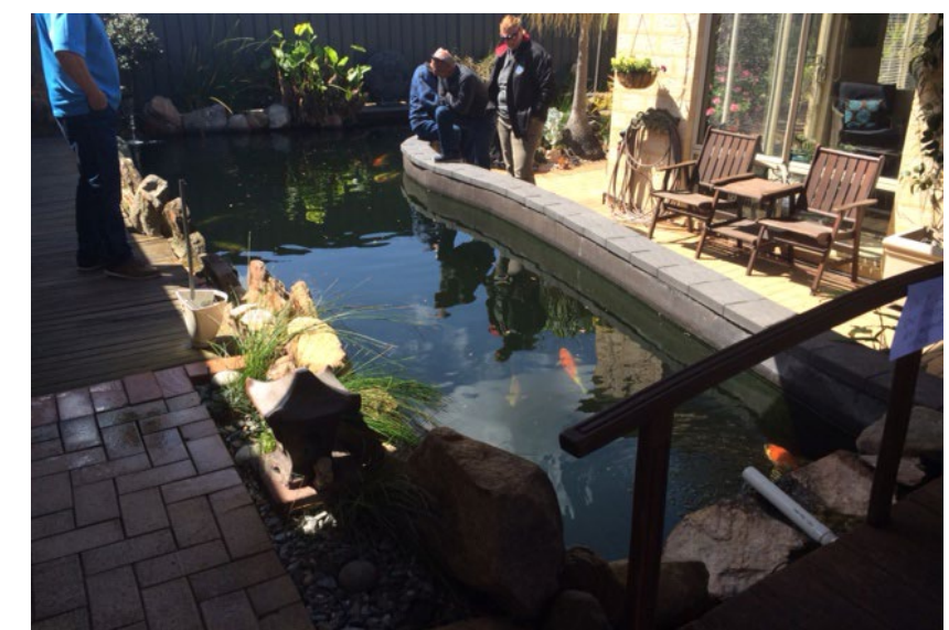
Above: Looking in to Tony's backyard pond paradise

Below: Quite a lot of great fish in the one pond