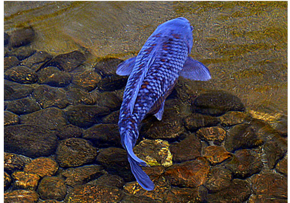
in the large koi pond at Maruoka Castle, Japan.

You don't need to have any book-keeping experience (we will teach you that). If you want to have a trial with the position, or even if you think you could help with PART of the job, please call any Committee Member (phone numbers on page 2)