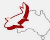
Table Show Helper