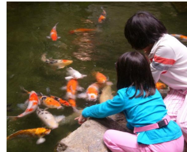
Pictured is the koi pond inside Changi Airport in Singapore.