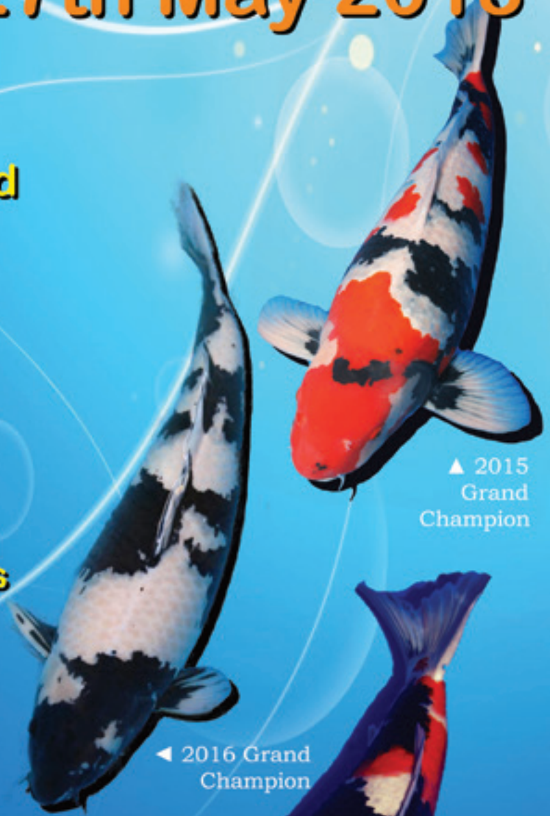
▲ 2015 Grand Champion