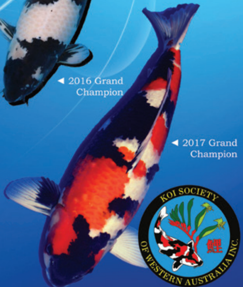
◀ 2017 Grand Champion