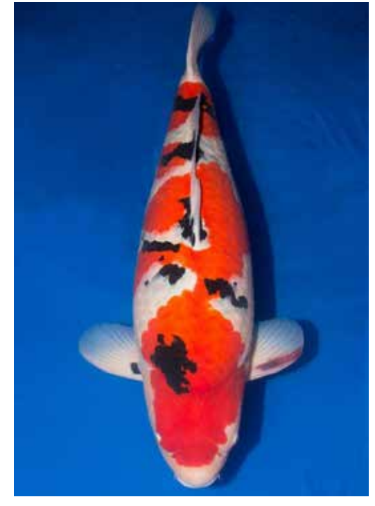
Above: South East England Koi Show Grand Champion Owned by Raad Hassan