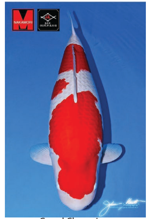
Grand Champion, The 10th Asia Cup Koi Show 2017