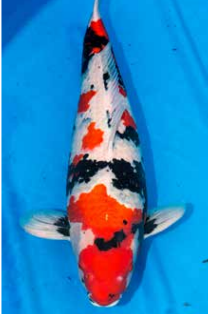
Phong Ta, 76cm Showa