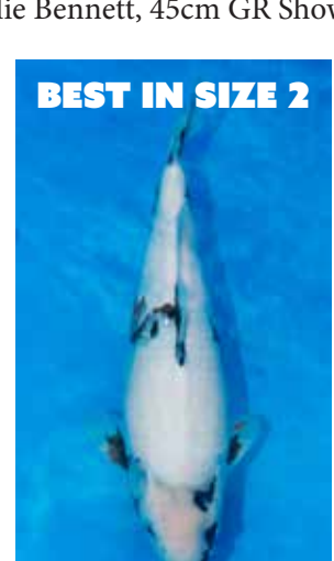
Todd Bennett, Utsurimono