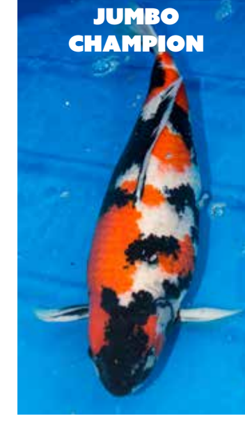
Allan Bennett, 76cm Showa