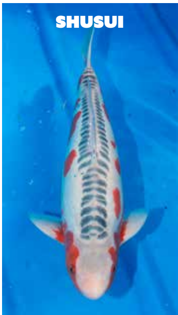
Allan Bennett, 54cm Shusui