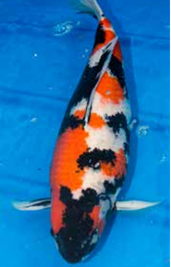
Allan Bennett, 76cm Showa